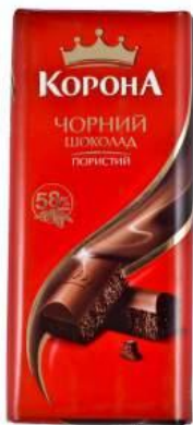
Chocolate bar "Korona" black 90g/40 $1.00