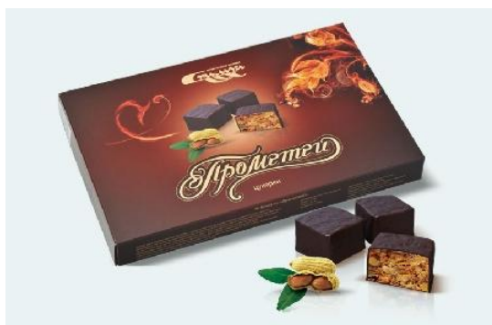
Sweets "Prometei" 275g/6 $ 3.25