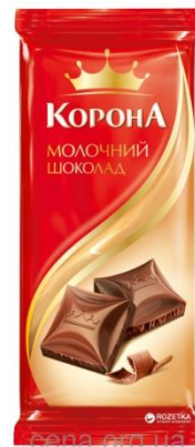
Chocolate bar "Korona" aerated dark milk 90g/26 $1.00