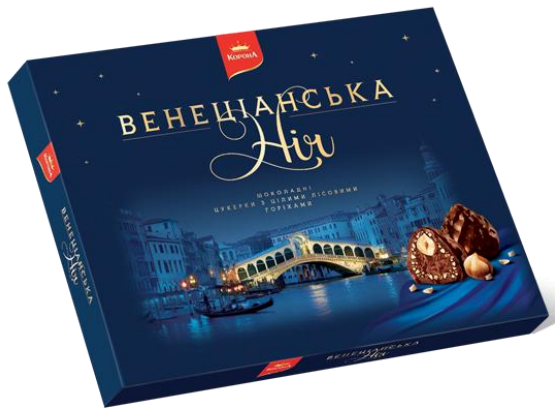
Sweets "Venezianskaya noch" 252g/6 $4.65