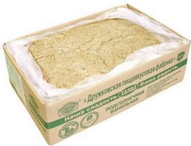
Halva loose "Vanilla" 11lb - $1.00