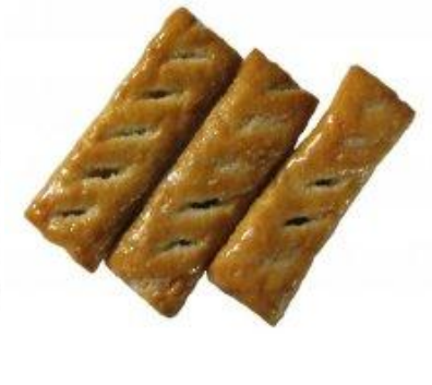
Cookies "Marishel" $1.20