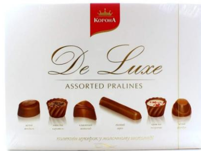
Sweets "De Lux" milk 254g/5 $4.25