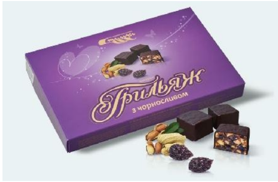
Sweets "Griliyazh w chernosliv" 275g/6 $3.85