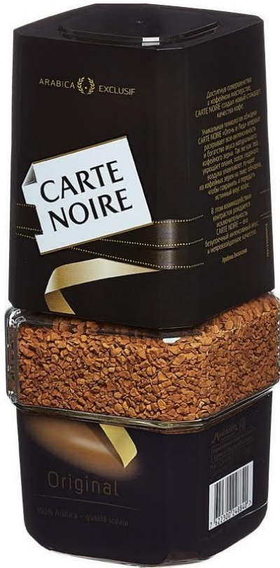
200g/6 - $12.50