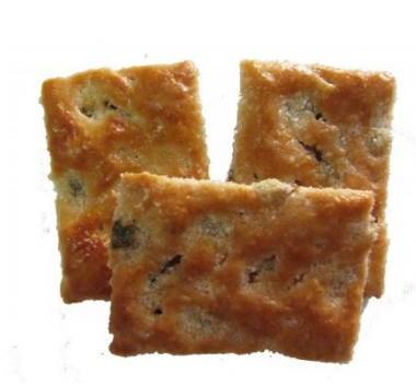
Cookies "Izyminka" $1.35